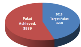
TARGET HSE MS 2.5